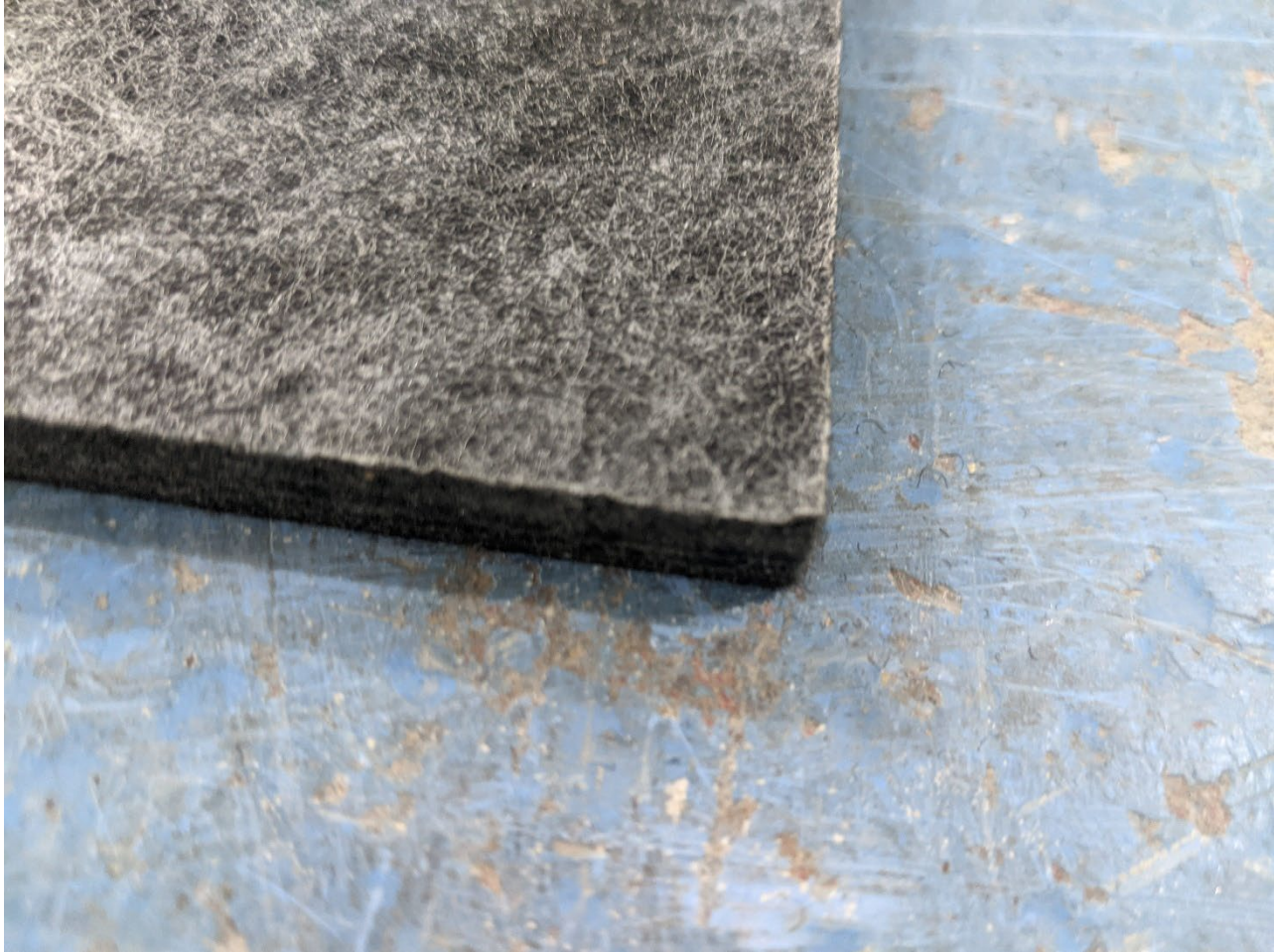
Figure 3 – Detail of specimen materials